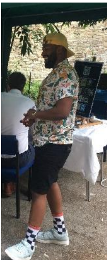
The Lord Mayor at the BBEST 'Countdown to the Consultation' Forum 7/7/18